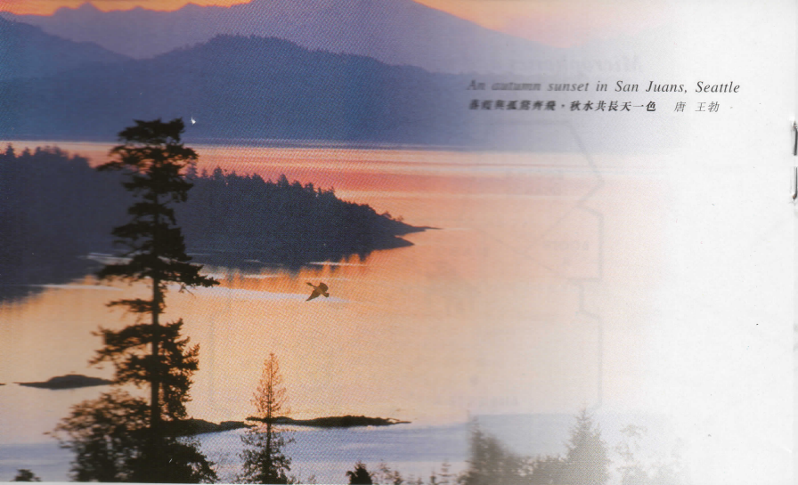
An autumn sunset in San Juans, Seattle