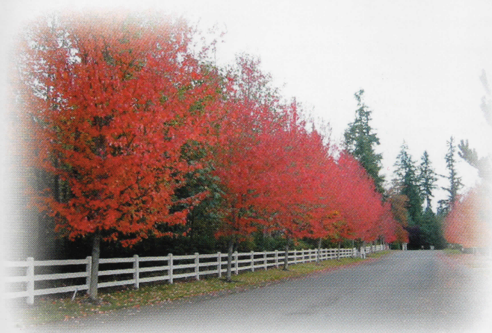
A maple forest in autumn, Seattle 停車坐看楓林晚，霜葉紅於二月花 唐 杜牧